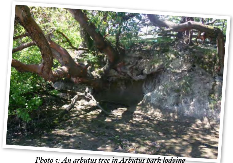
Photo 5: An arbutus tree in Arbutus park lodging under extreme erosion