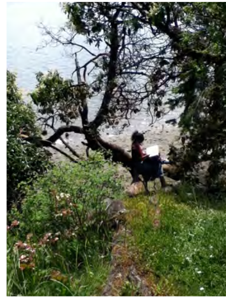
Photo 8: Path on Southern side of Arbutus Park leading to fallen, but living, arbutus tree