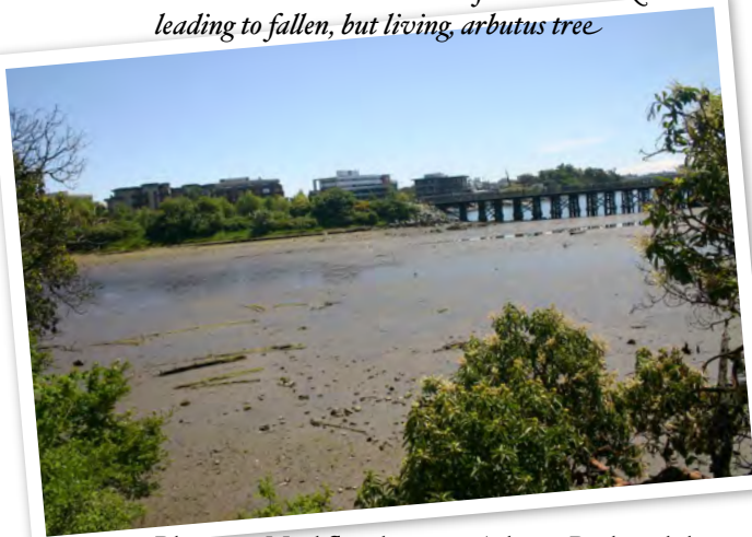
Photo 10: Mud flats between Arbutus Park and the Selkirk trestle bridge