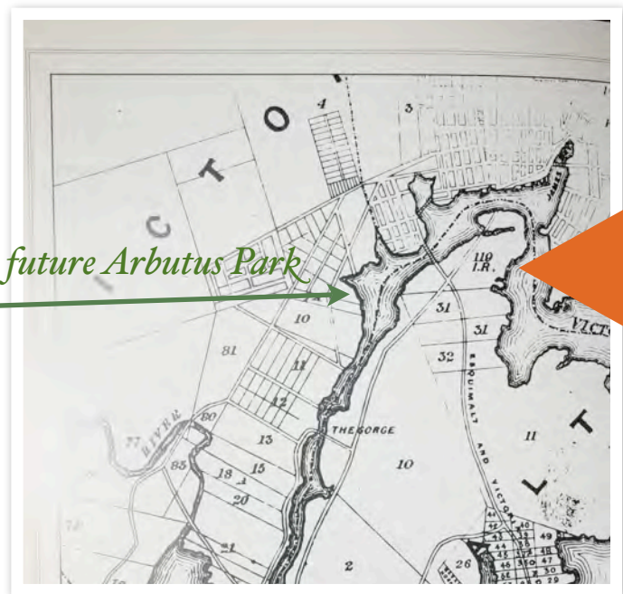
Figure 2 : Map of area from 1885

day Arbutus Park (figure 1 and figure 2). He describes the reservation thus, “The houses look very old. They are built of large planks which the Indian had cut, with much labour, from monstrous trees.” [Rohner pg 21] One wishes that Boas was more exact about what qualifies as “monstrous”, but it is understood that very large trees were probably once found in the area of the Selkirk water.