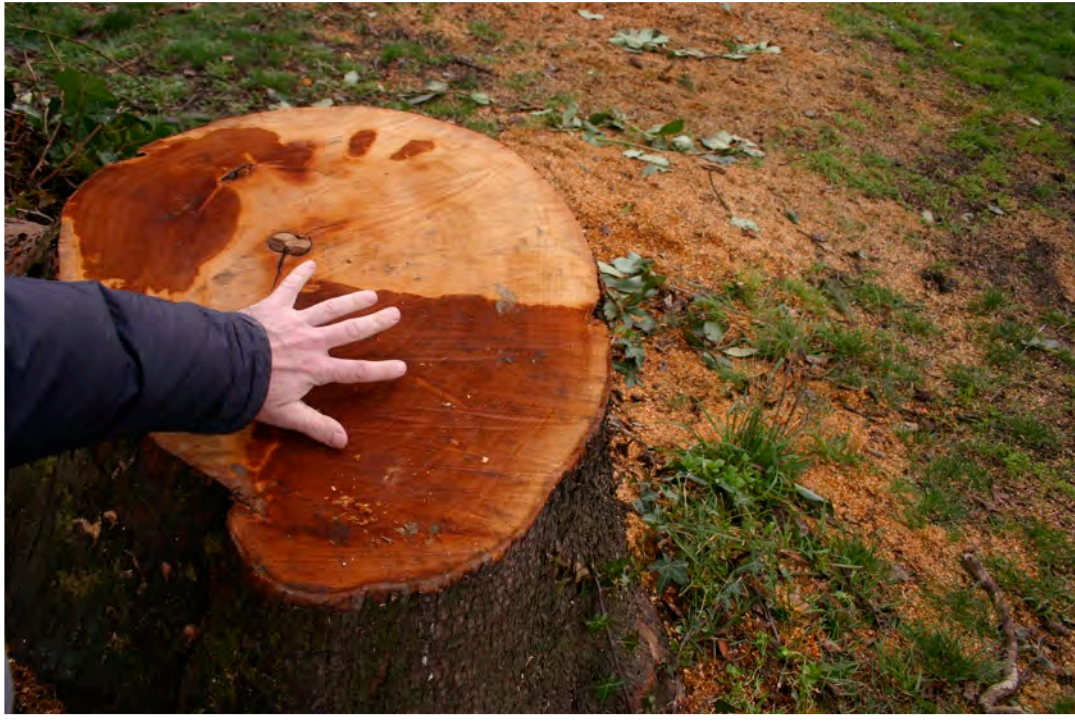
Photo 12: Stump of the 120 year old arbutus tree cut by the City of Victoria Arbourist Crew.